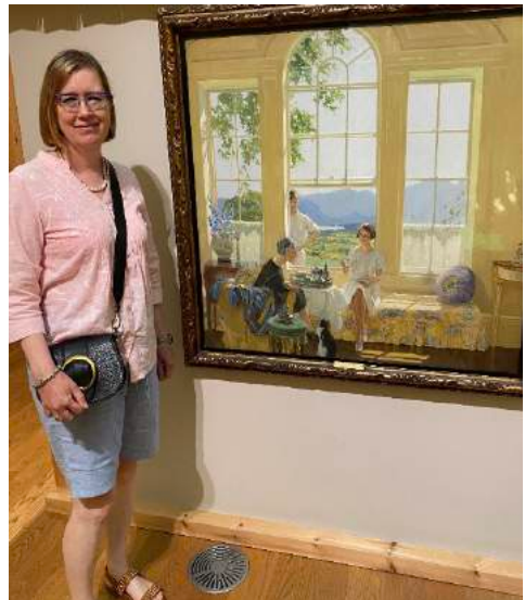
Working hard at the conference in Manchester Me with one of my favourite pictures!