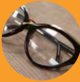
A Lovely Cat Eye from Tom Davies

Cat-eye frames are another popular choice, especially for those with round or oval face shapes. These frames are characterized by their upswept corners and can add a touch of drama to any outfit. They are perfect for those who want to add a little vintage flair to their look.