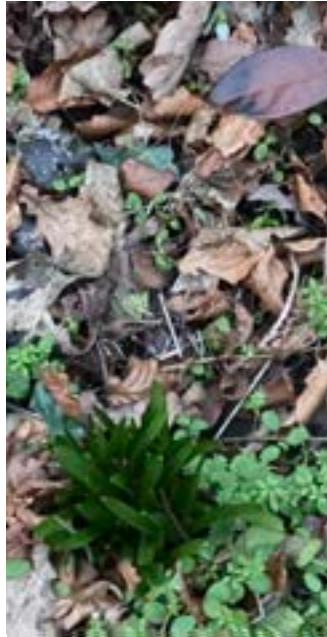
First Snowdrops of 2023!