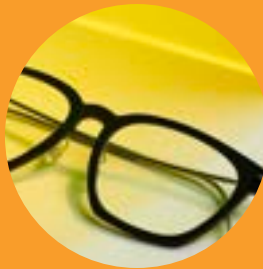
A Lindberg twist on the classic Wayfarer

First up, we have the classic Wayfarer. This iconic frame style has been around since the 1950s and shows no signs of going out of style. With its distinct shape and timeless appeal, the wayfarer is a great choice for those who want a classic look that never goes out of fashion.