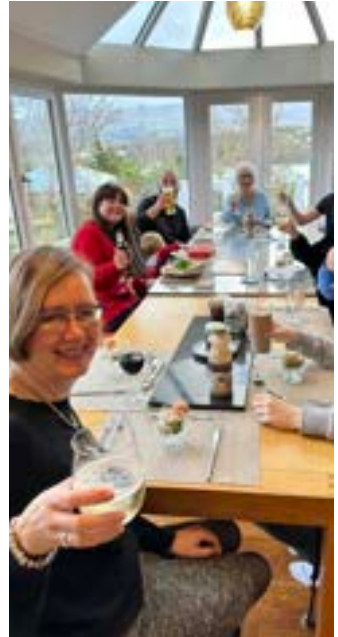
Boxing Day 2023!