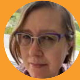
Me in my Orgreen Cat Eye