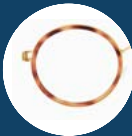
A Classic titanium Round Eye with an acetate insert by Lindberg.

Next, we have the Round Eye frame. This style has been on the rise in recent years and for good reason. Round frames add a fun, whimsical touch to any outfit, and they're especially flattering on those with angular or square face shapes.