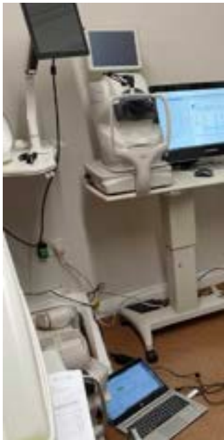
Not going well

I am actually sitting, at this moment, in our new upstairs fitting room as our brand new Optical Coherence Tomographer (OCT) is installed. It is an exciting time for the practice but right now however, from what I can over hear, the install is not going 100% smoothly. Sitting behind this computer seems a very sensible place to be!