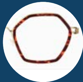
And again, but with a modern twist.